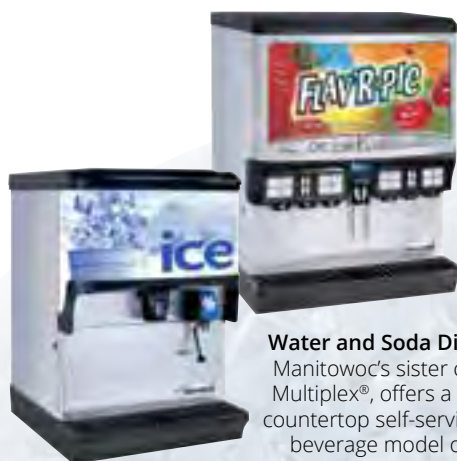
Water and Soda Dispensers Manitowoc's sister company, Multiplex®, offers a complete countertop self-service ice and beverage model offering.

Find the perfect ice machine pairing with Manitowoc's wide variety of ice storage bins and dispensers.