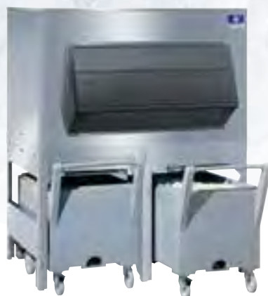
Ice Storage Bin and Cart System

Equipped with ice gate for increased employee safety, easier ice removal, and reduced spillage. The 30" (76.2 cm) model is one of the smallest footprint large capacity storage bins available.