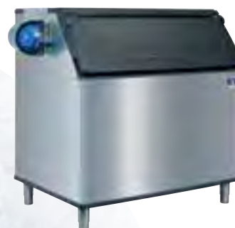
D-Style Ice Storage Bins

Available in 22" (55.9 cm), 30" (76.2 cm) and 48" (121.9cm) widths. Featuring one-piece corrosion-free composite-resin base, impact-resistant polyethylene bin liner, soft durameter trim that helps silence bin closing, internal scoop holder and protectant bumper guards. Optional Multi-mount external scoop holder also available.