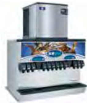
iT420 ice machine on Multiplex® MDH-302 beverage dispenser

Manitowoc dice or half dice cubes crushed into small pieces using a Manitowoc machine and a Multiplex® beverage dispenser equipped with icepic® ice crusher. Provides a selection