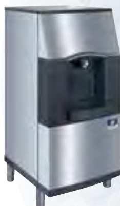
SPA and SFA Series Ice Dispensers

Available in 22" (55.9 cm), 30" (76.2 cm) and 48" (121.9cm) widths. Featuring one-piece corrosion-free composite-resin base, impact-resistant polyethylene bin liner, soft durameter trim that helps silence bin closing, internal scoop holder and protectant bumper guards. Optional Multi-mount external scoop holder also available.