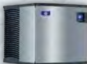
Modular Ice Machines

Featuring high-volume dispensing with patented "push-for-ice" rocking chute dispense mechanism and paddle wheel technology. Also available in an ice and water dispensing.