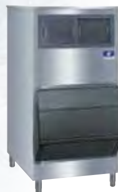
F-Style Large Capacity Ice Storage Bins

Available in 22" (55.9 cm), 30" (76.2 cm) and 48" (121.9 cm) widths.